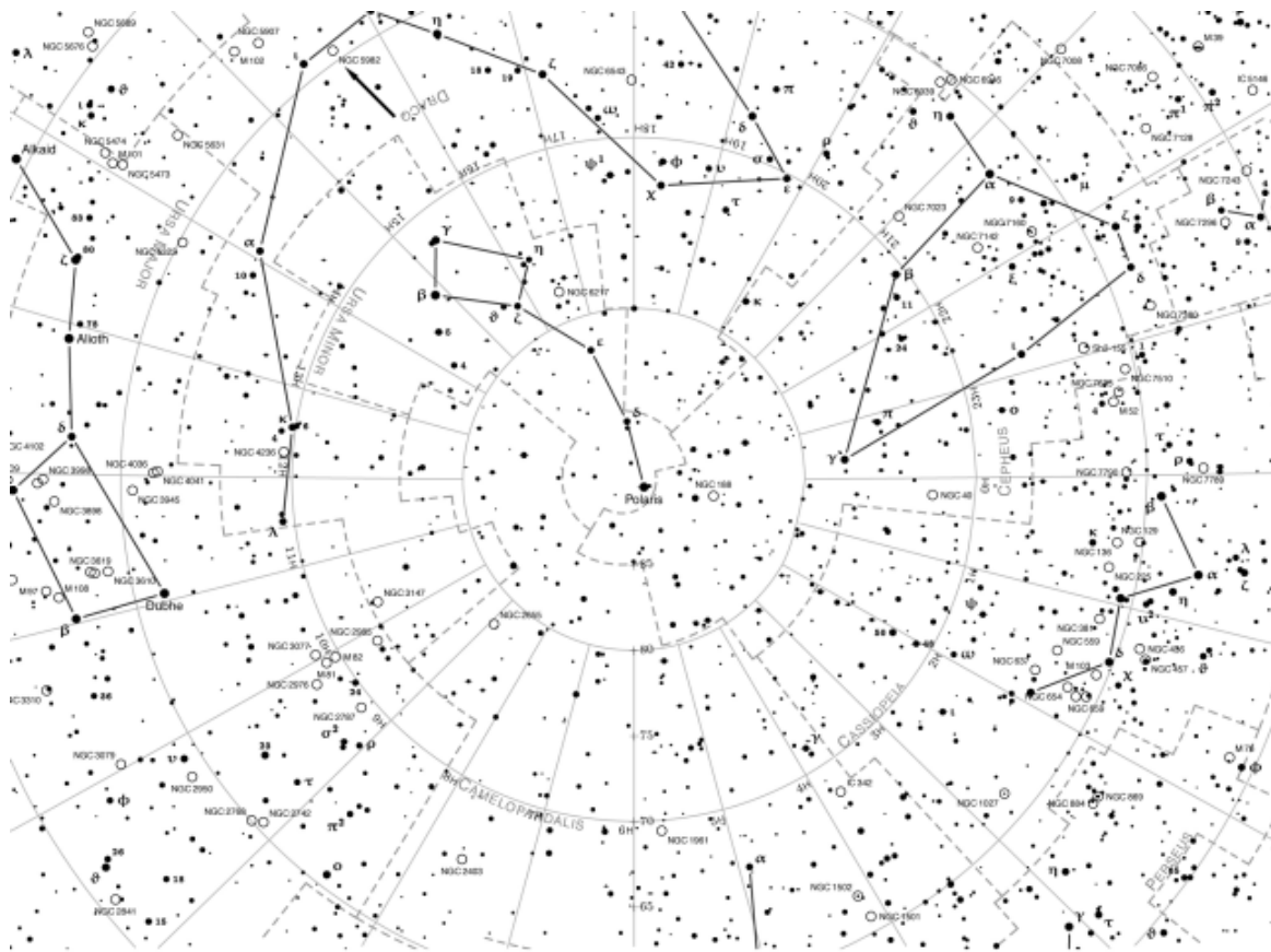
Chart 1: Declination North of +65°

Magnitude: 0.0 1.0 2.0 3.0 4.0 5.0 6.0 7.0